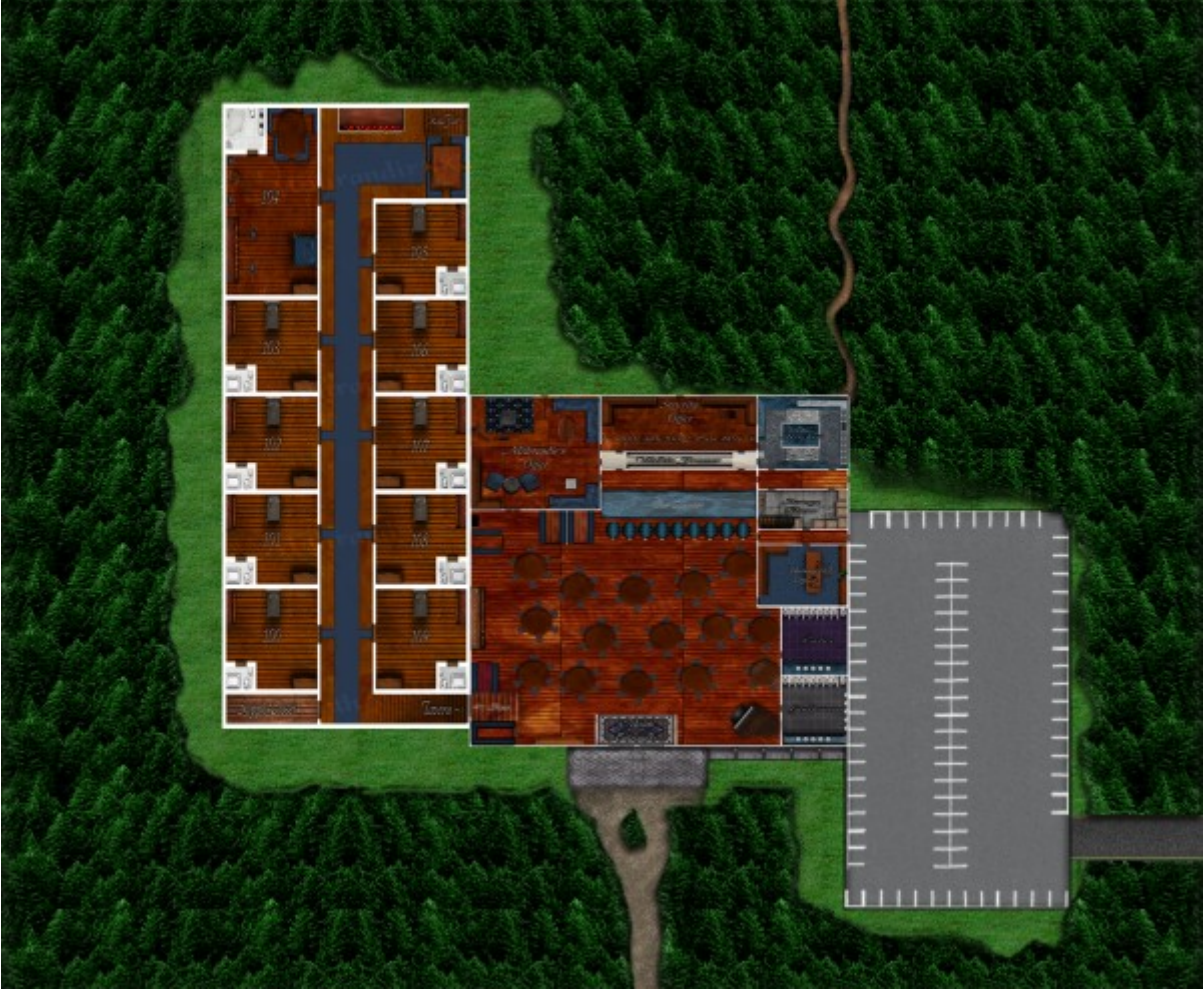
Above is the Presently most accurate map of the Tayern Inn and surrounding lands