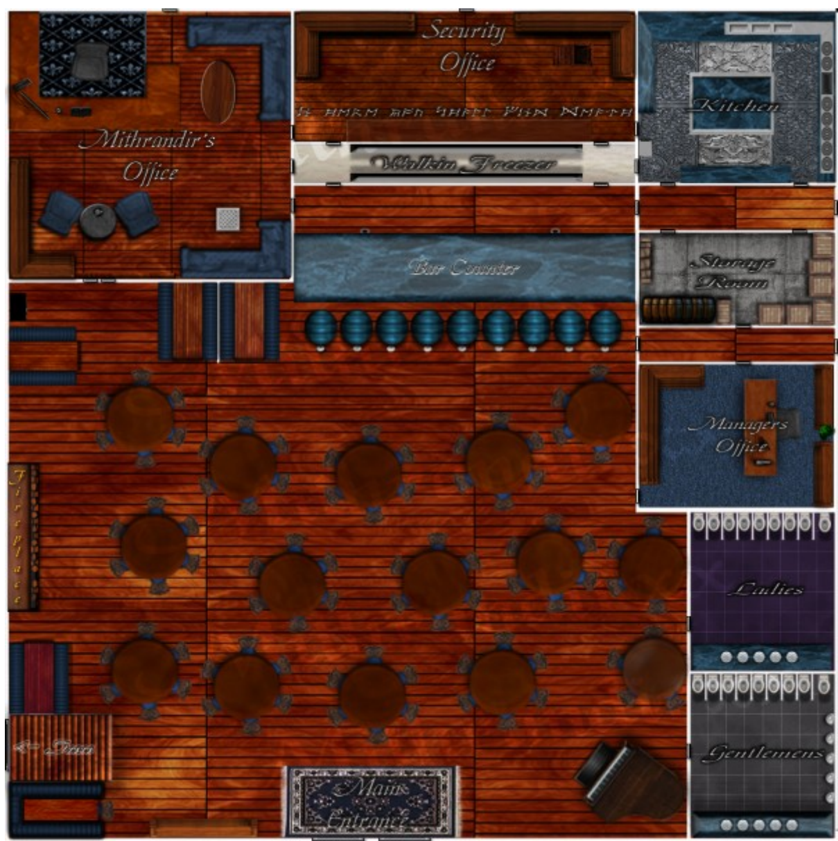
Above is the Presently most accurate map of the interior of the Tavern