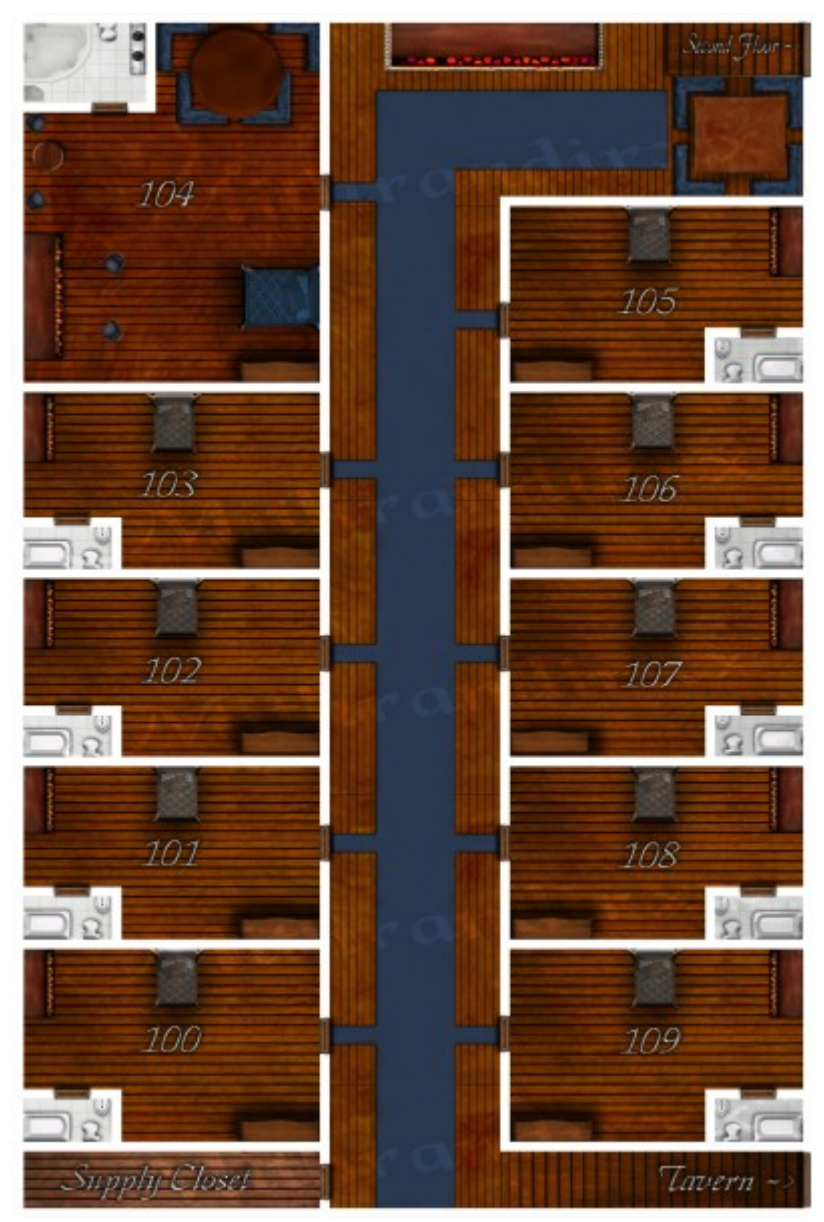
Above is the Presently most accurate map of the interior of the Inn