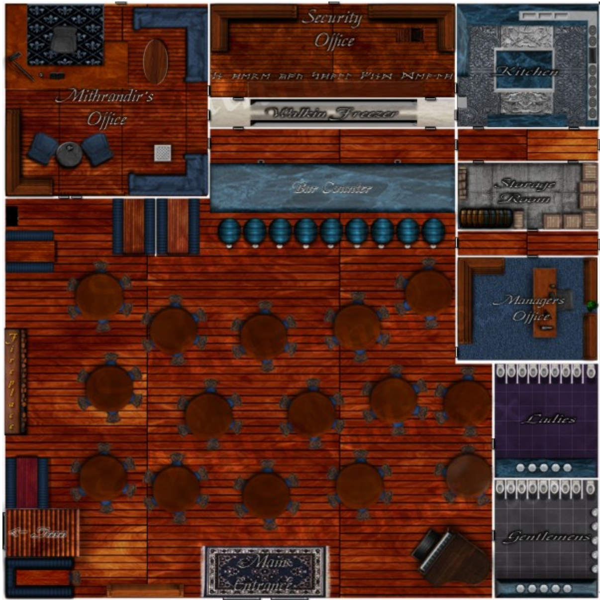
Above is the Presently most accurate map of the interior of the Tavern