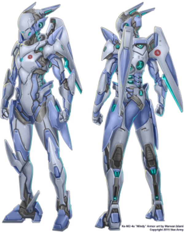
Ke-M2 Series "Mindy" Power Armor